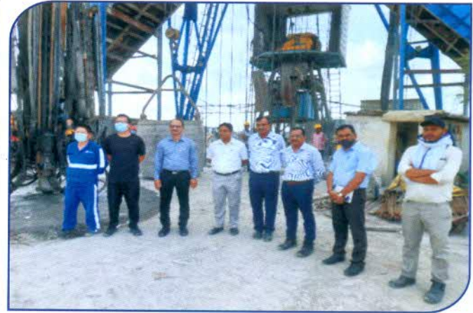
Inspection by CVO, MOIL at Gumgaon Mine.